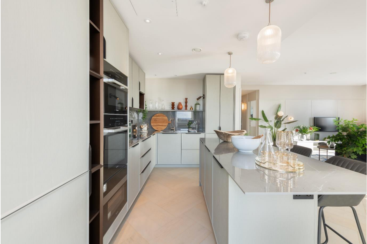
Kitchen with Breakfast and Dining areas and south Balcony with views over London