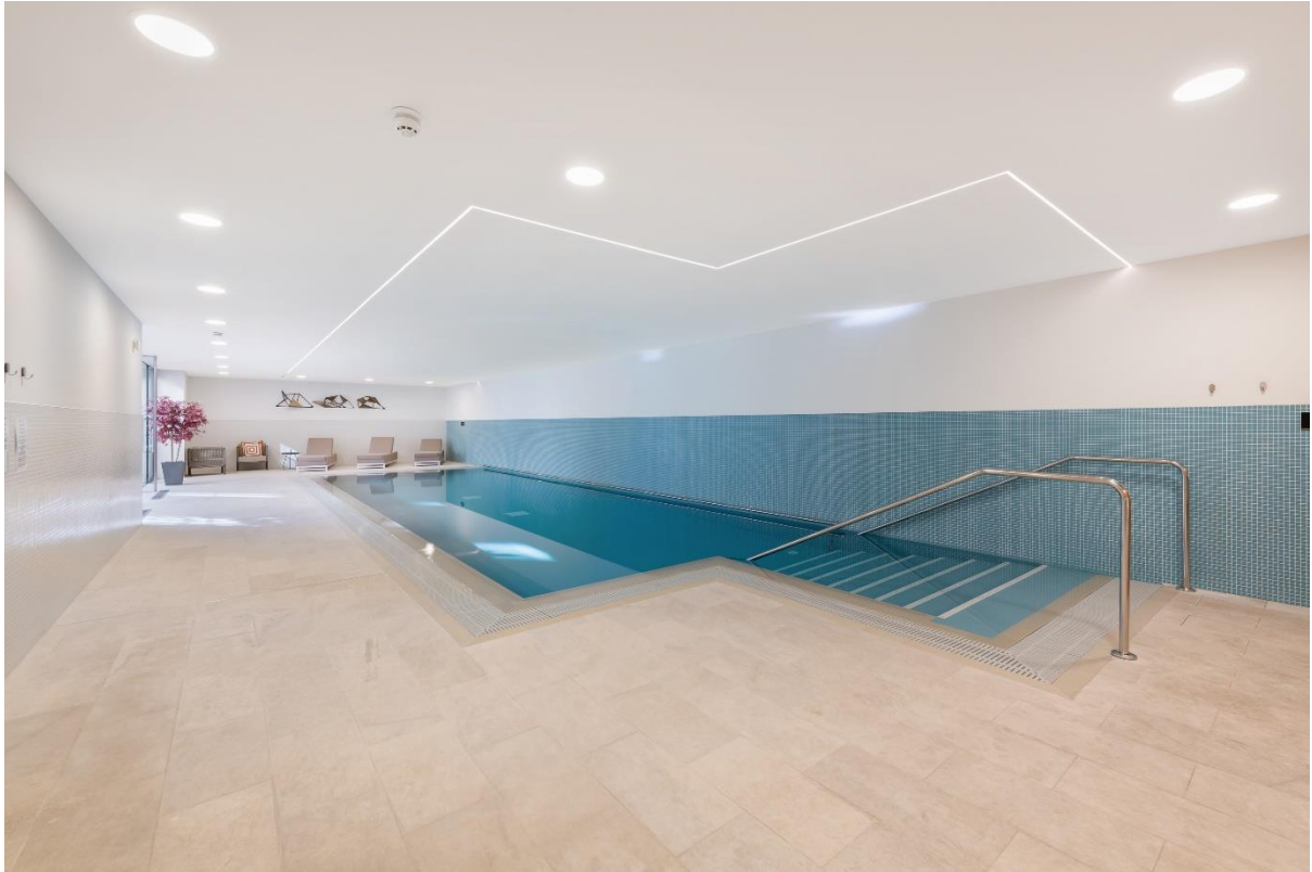
Swimming Pool and Gym