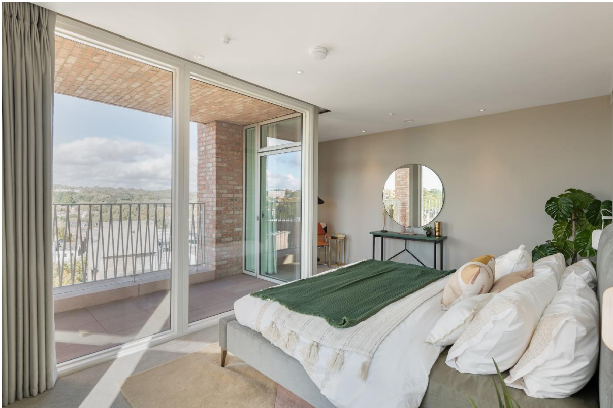
Principal Bedroom with north balcony and views to Hampstead Heath