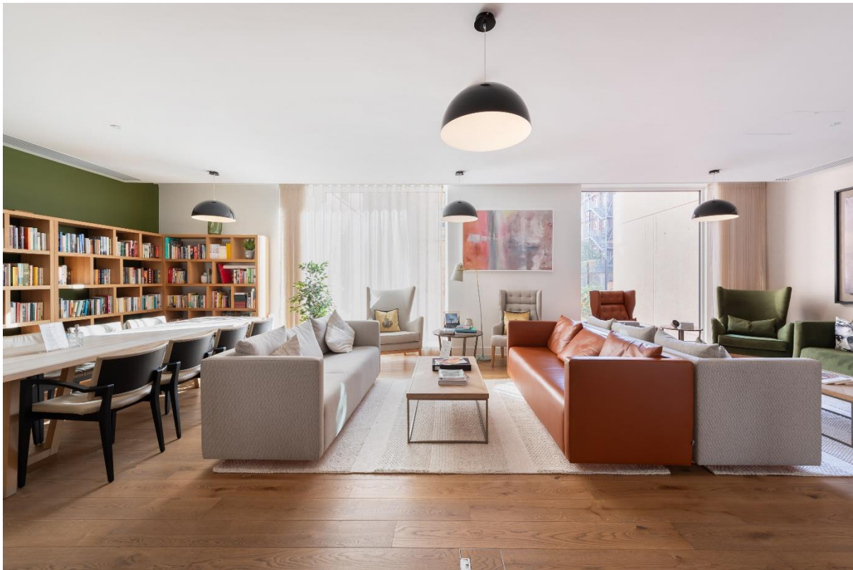
Club Lounge and 6th Floor Roof Terrace